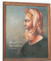
Author of Materia Medica

The academy organises the following annual days : 1. Ibn Sina memorial lecture sponsored by National Council for Promotion of Urdu Language, Govt. of India, 2. World Health Day, 3. AIDS Day and 4. Museum Day. Invited Lectures, Seminars, Symposia, by persons of eminence and group discussions are also organised on topics concerning history of medicine, sciences, art and culture. News regarding history of medicine and sciences from all over the world is published in the Ibn Sina Academia newsletter and more than 30 books are published so far. IAMMS has been recognised by CNN Travel for the