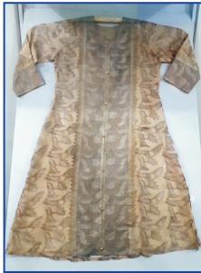
Silk Kurta With Golden Threading