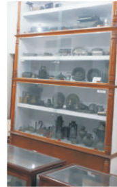
19th Century Crockery

This Museum is located on the 2nd floor and has four main galleries. The crockery gallery has a large collection of oriental and British India utensils, hamami-plates, bowls, tea sets belong to many prominent personalities like Hakim Ajmal Khan, Nawab Sultan Jahan, Nawab Shahjahan Begum of Bhopal, Nawab Yusuf Ali Khan of Rampur and others. The textile gallery consist of attires, garments, calico of gold and silver studded precious stones and many other oriental clothes. The picture gallery has pictures, drawings, water colour, photographic prints and paintings especially of people belonging to Aligarh and Aligarh Muslim University.