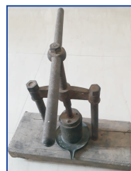
Almond Oil Extractor

The Museum is an academic unit with collection and exhibits. The main theme is the history of health and disease in a cultural perspective, with focus on the material and iconic graphic culture of medieval medicine and sciences. The Museum has, specifically, the illustrations and busts of physicians belonging to Mesopotamia, Babylon, Egypt, Greek, Arab, Iran, Central Asia, and Indian Civilization, specially of Delhi & Lucknow Unani School of thoughts.