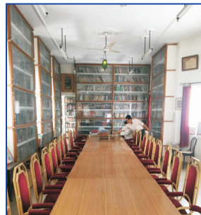
Zillur Rahman Library

The library at present houses one of the most precious and valuable collection of manuscripts, rare books, microfilms and a large number of periodicals. Tabarruk of important religious persons are also safely kept.