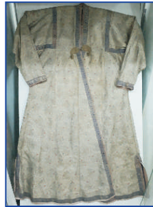
Chaugha with Gold Threading