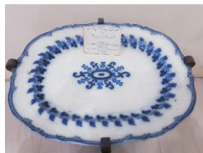
19th Century Quab

Miscellaneous gallery has many objects like coins, postage stamps, gemstones and engravings including vintage cameras, clocks, busts, pens, memoirs and relics of prominent personalities. In the same gallery there are some separate family collections. In addition there is a separate 'Skins and Taxidermy collection' displayed on the ground floor.