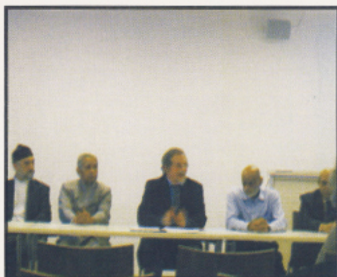
Panelist during the Valedictory Session